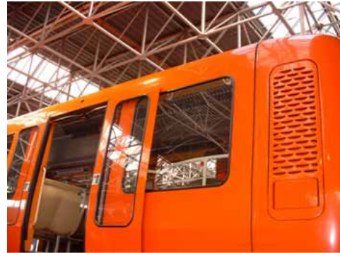
Graffitigard is protecting municipal trains world-wide from vandals.

Protect your public interiors and surfaces from deliberate and unintentional damage with Solar Gard graffiti protective films!