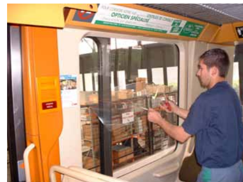
Graffitigard film is easily peeled away when it is vandalized, allowing professional installers to quickly apply a fresh layer.