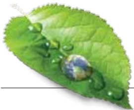
Architectural solar control window film life cycle

When the full product LCA is complete, a detailed report is written incorporating all of the information in the analysis. A third-party reviewer, not associated with the organization submitting the report, reviews the data and format of the submittal to ensure it is complete, accurate, and complies with the ISO 14025 procedures for creating a Climate Declaration. The entire process ensures that product manufacturers have followed a systematized, transparent and consistent process, resulting in an accurate and credible report.